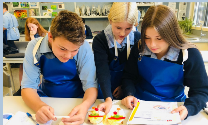
Students from Ms Khokhar's year 9 class constructed brain models using an orange and different types of lollies to represent parts of the brain last week. They had fun working together for this fun, hands on experience.