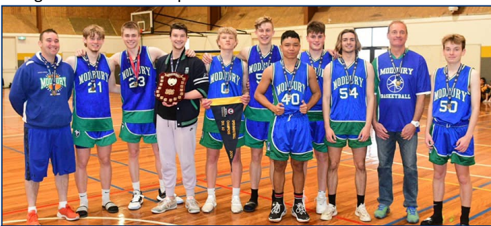
Senior A Boys A2 Grand Final Winners