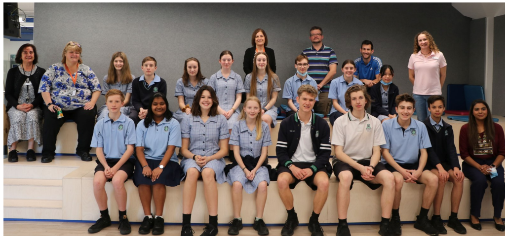
Special recess for students who obtained the maximum number of A grades in term two